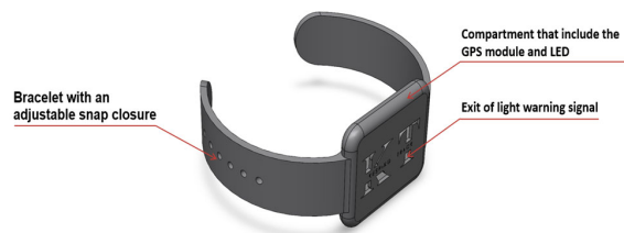
Fig. 2. Prototype

Engraving of the KeepingTrack logo will allow light to exit the interior via a grille/grid.