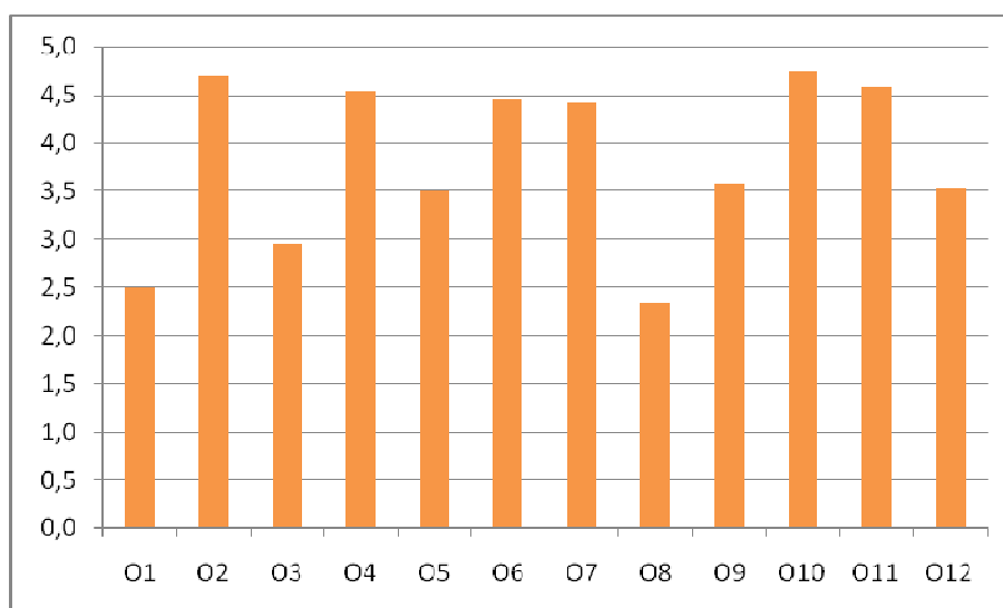
Figure 3. Orange team students' motivation

We have noticed that some of the MUTW students in the first edition were not being credited for their work in MUTW. Although this is a scenario that shall not happen in the future, it might have been one of the main reasons for low levels of motivation. Students that are moved by extrinsic motivations, highly indexed by their ECTS credits, need this incentive to feel committed. It was however interesting to notice that some students were moved by intrinsic motivations and that MUTW provides these incentives to students.