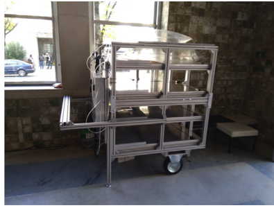
(a) The hall of Physics Department