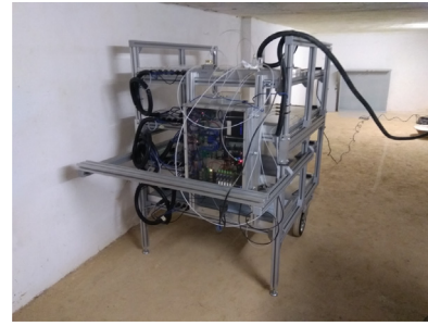
(b) Gallery in Lousal mine