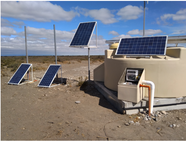
Fig. 1. Peter Mazur station during deployment November 2019. The precast is underneath the tank and housing the four RPCs.

The poor high voltage insulation allows for currents to flow between the high voltage electrodes. The magnitude of the currents is correlated with the room relative humidity. But due to pandemic, minor advances were done to solve this problem.