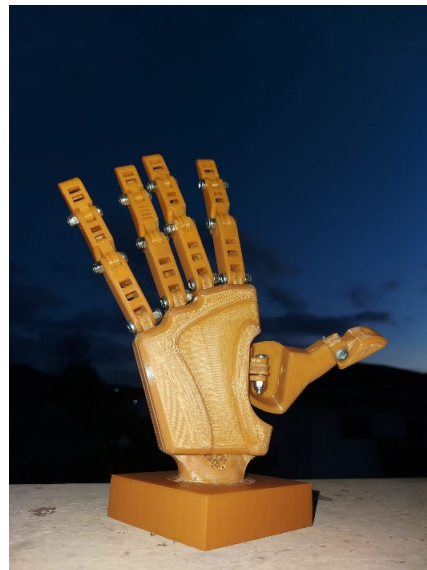
Fig. 1- Biomechanical Hand

The 3D hand model was developed in SolidWorks software and is made of PLA (Fig. 1). It allows familiarization with the shape of a human hand to facilitate contact with the patient. Servomotors connected to the fingers by nylon wires allow the movement of the finger joints. In addition, the system also consists of a glove, which should be worn by the patient to replicate the movements performed by the hand, and a website that allows the health professional to manage his patients and prescriptions and also to establish the angles of the fingers and number of repetitions that the user should perform.