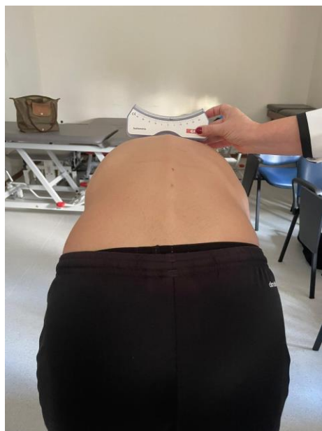
Figure 1. Measurement with a scoliometer.

contact teachers to proceed, before or after classes, to explain the objectives of the study, inclusion and exclusion criteria, time required to complete a questionnaire that included the collection of sociodemographic and anthropometric data, intensity of pain felt at the time, presence or absence of musculoskeletal problems, existence or non-existence of restriction of activities due to these problems, and carrying out a clinical assessment to identify the presence of postural changes ascertained with a simple anterior torso tilt test (Adams test) after which, if it were positive, a measurement with a scoliometer would be applied to evaluate and quantify humps (Figure 1).