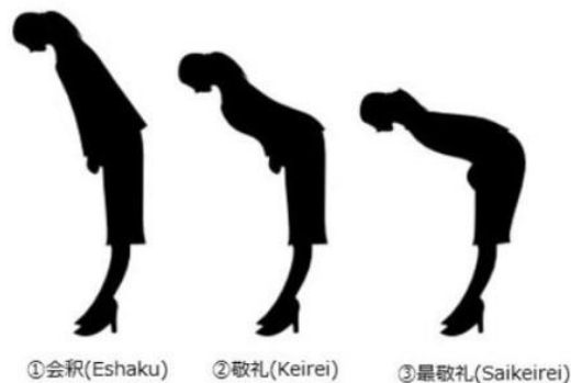
Figure 1: Three types of bowing in Japan.

Bowing is used to greet, thank, and apologize. In Japan, how far one bows is directly correlated to what they are trying to convey to the other person. The Eshaku 102 is a bow at around 15°, and it is the most common type of bow. It is a more relaxed way of greeting, and it is the one commonly used among people of the same strata. The Keirei 103 is a bow at 30°, and it represents a more respectful way of greeting, or a deeper apology. The Saikeirei 104 is the bow at around 45°, and it is the most respectful type of greeting and apology. The longer the bow, the more respect and honesty it bears.