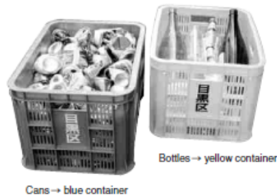
Cans → blue container