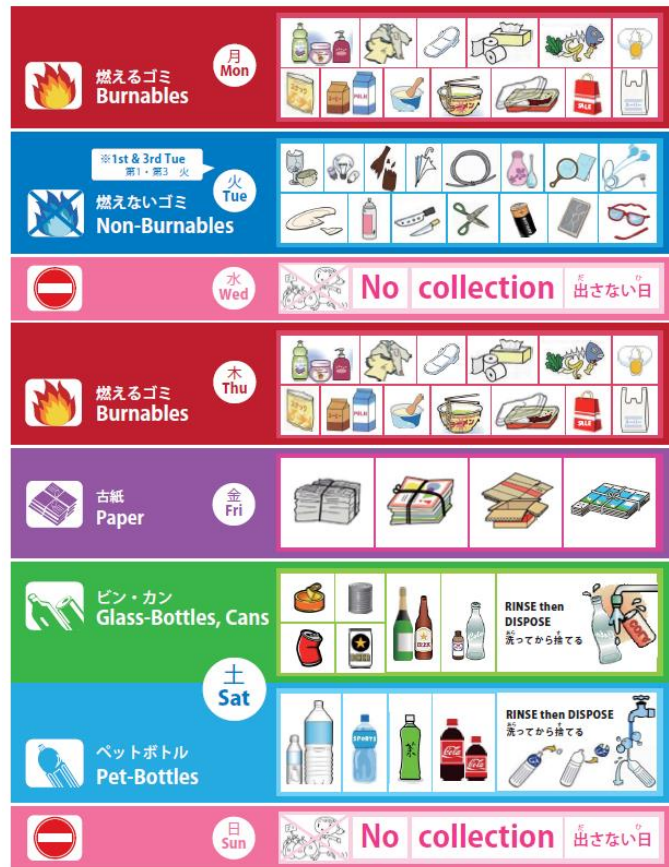
Figure 3: Collection Dates for Garbage & Recyclables by Sakura House for Yutenji, Tokyo.

Sanitary and public health is very important for the Japanese. Another example of how this applies to their daily lives is the existence of several laws on smoking. Smoking is forbidden in most public places, or when walking on the streets. Smokers are expected to go to the nearest smoking points. Since we were on a shared house, we were told from the onset that smoking in or outside the house was forbidden, and the closest smoking point was at a walking distance of eleven minutes. Smokers should also utilize portable ashtrays, and avoid littering, under the penalty of a fine.