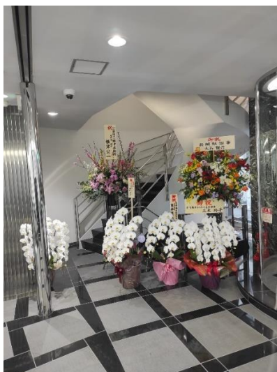
Figure 2: Flowers sent to the Embassy of Portugal in Tokyo by people who were unable to attend the inauguration of the Embassy's new building.

This habit is also related to celebratory dates. On days like Valentine's Day, White Day 110 , and Hinamatsuri 111 , workers from the Embassy would exchange chocolates and traditional gifts/foods amongst themselves. Despite not having a personal relationship with one another, it is part of the Japanese culture to celebrate these dates with all those around. Working on celebratory dates in the embassy was very enlightening as to the cultural differences between Portugal and Japan. Days like Father's Day or Mother's Day are celebrated in very different manners, with different traditions and in different dates. It was also interesting to understand that while Portuguese celebrations value family and religion, most Japanese celebrations value nature (for example, with the Earth Day) and love (with Christmas being celebrated amongst lovers instead of family, and having several days dedicated to the spread of love).