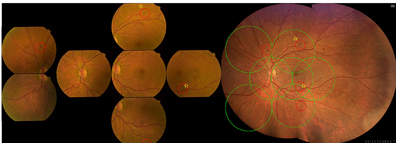
Fig. 2 35° ETDRS 7-fields images and CLARUS 500 images of a patient graded with the same DR level in both devices – 47 A (moderate Haemorrhages and Microaneurysms (red circles) in 4 fields and IRMA definite present in 2 fields (yellow star)

These results show that UWF imaging devices can be a useful alternative to the laborious and unfriendly method of acquiring 7 different images of the peripheral retina with only 30° FOV and documenting only 35% of the entire retina surface.