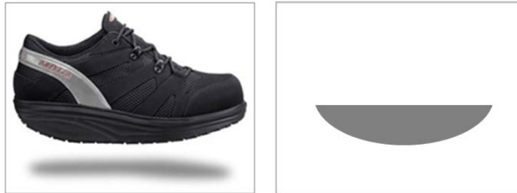
Figure 2. Illustration of a kind of unstable shoe construction and a schematic representation of the see-saw adopted in various studies to induce an unstable support base.

Studies about postural control when standing on a see-saw have devaluated the role of the information provided by muscle spindles, arguing that the higher changes in orientation provided by this kind of support surfaces makes it difficult to use proprioceptive information about the relative positions of successive links of the kinematic chain for the reconstruction of a body's position internal representation. [32, 44] As a consequence, the authors gave more importance to the information provided by the Golgi organ tendon. [32] However, it should be noted that the format of the unstable shoes commercialized is different from the see-saw used in previous studies (Figure 2), leading to lower levels of changes in segment orientation at the ankle joint, justifying the maintenance of the role of muscle spindles in this condition.