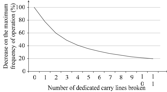
Fig. 1. Performance degradation

therein. When the file is retrieved and transferred into the FPGA, the processor responsible for the management of the logic space simply reads and stores this information and uses it if the need to relocate the function arises.