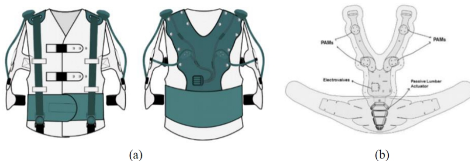
Figure 4: (a) In green, the removable components of the solution: Y-shaped structure, the pneumatic actuators, and the belt with the passive articulation; (b) the semi-rigid Y-shaped structure designed.

The lower end of the Y is connected to another semi-rigid structure - the passive actuator - that helps correct the posture, reinforcing the lumbar area, reducing the impact of the inclination of the trunk and head, and helping the user to return to its anatomical reference position (see Figure 4b). In addition, this semi-rigid passive actuator is also composed of a belt that fits around the lumbar and abdominal region to improve the exoskeleton's staticity. Since the elements in green (see Figure 4a) are removable from the vest, the vest is capable of being cleaned/hygienized.