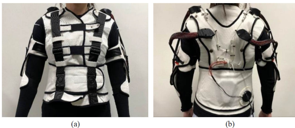
Figure 3: (a) Frontal view of the developed prototype; (b) Posterior view of the developed prototype.

For the construction of the proposed arms elements, two semi-rigid elements covered with the same knits as the vest were used. Those elements fix to the arm and to the forearm and are connected to each other through a screw creating a dynamic joint (located at the axis of the elbow) to follow the natural movements of the arm. The element attached to the arm is adjustable through an adhesive tape system to adapt to the different measures,