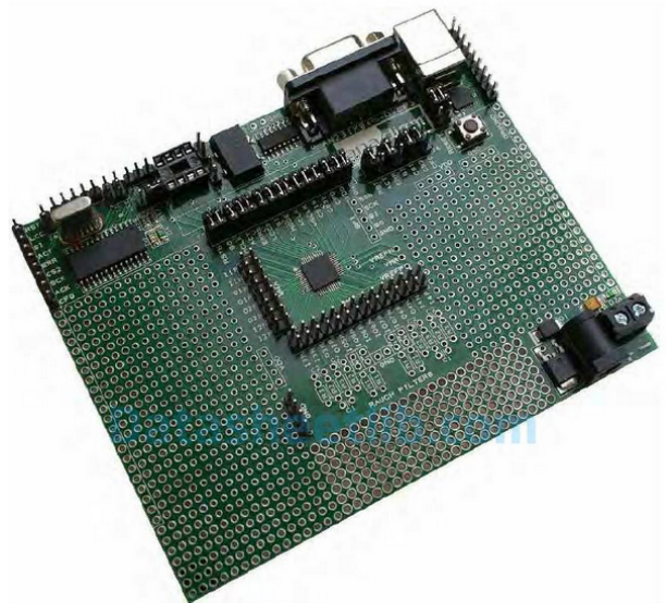
Figure 2. The FPAA development kit.