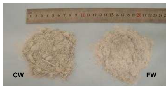
Fig. 1. Coarse (CW) and fine (FW) pultrusion waste.

PM specimens were prepared by mixing an unsaturated polyester resin -Aropol FS3992- (20% w/w), with different sand aggregates/GFRP waste ratios. Siliceous foundry sand, with rather uniform particle size and an average diameter of 245 \mu\text{m} , was used as sand aggregate. Applied GFRP waste material was supplied by a local pultrusion manufacturing company, and it was proceeding from the shredding of the leftovers resultant from the cutting and assembly processes of pultrusion profiles. GFRP waste was further processed by milling on a heavy-duty cutting mill laboratory unit, using bottom sieves with different perforation sizes inside the grinding chamber. Obtained recycled products, hereinafter designated by coarse (CW) and fine (FW) pultrusion wastes are illustrated in Fig. 1.