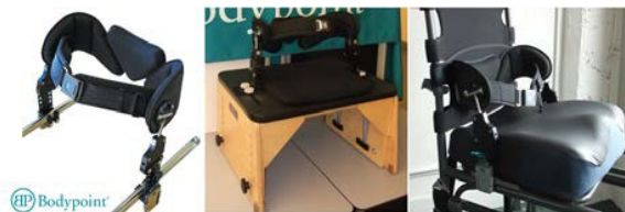
Fig. 1. Hip Grip pelvic stabilizer applied in a bench and in a wheelchair.

Although Bodypoint indicate some beneficial effects of using Hip Grip, especially in terms of a greater capacity to reach, there is no known data regarding its influence on upper limb movement quality. Reaching is considered as an essential component for movement and to perform activities of daily routine [19]. Children with postural control problems, including cerebral palsy, have slower movement patterns, less efficient movement and less coordination when compared with typically developing children. They take more time to perform movement, have a longer reaction time, a longer and non linear path and larger number of unit movements, verifying that additional difficulties arise when developing more demanding tasks, particularly in reaching and grasping [20,21,22, 23]. It is considered to be an efficient movement that one which moves directly to the target without the occurrence of strange or unusual movements [19]. Kinematic analysis is a possible measure of upper limb performance used in studies with these children [20,22,23] and consists of describing the movement observed in function of time and space, providing information about the linear and angular displacements of the joints, velocities and accelerations of body segments.