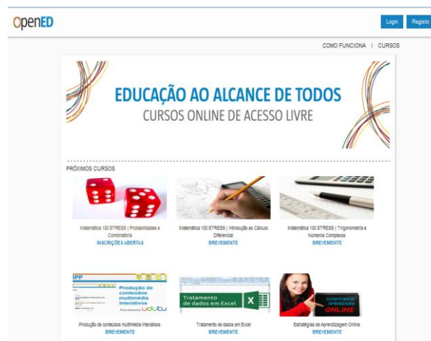
Figure 1: Screen Shot of http://www.opened.ipp.pt (12/07/2014)

The e-IPP project – e-Learning Unit from Polytechnic of Porto – was born with a generic and globalizing vision, focusing on the development and implementation of new ways of teaching/learning/training among the IPP Community and in its area of influence, with an innovative and dynamical attitude, targeting training needs throughout life, through a continuous learning process, consistent with advances in science and communication technology, enhancing/facilitating/promoting space and time extensions. Following its goals – Promotion and development of distance education in a national and international level, fostering research and the use of digital pedagogical practices adapted to the style and the technological learning contexts promoting/implementing an educational model that allows to support/follow the student/graduate – the e-IPP created, as we have already stated, its own MOOC platform – OpenED. Accessing the OpenED site www.opened.ipp.pt (see Figure 1) participants can see the available courses as well as they can suggest new ones, by using an integrated message system.