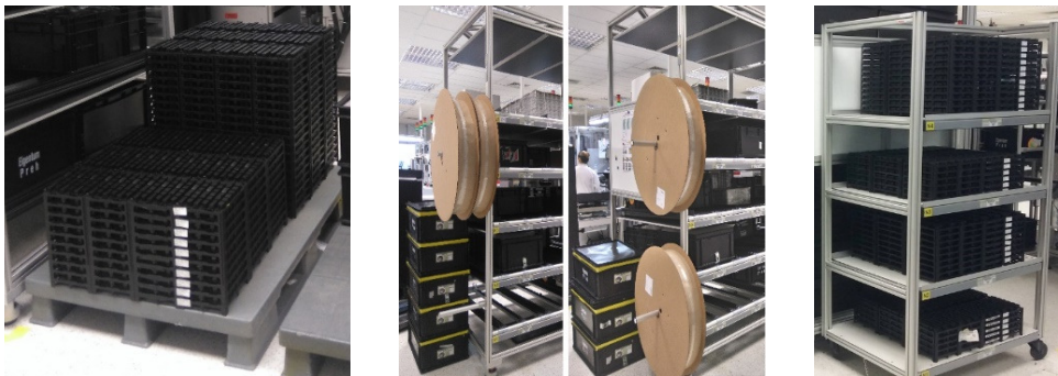
Figure 2. Changes 1, 2, 3 and 4.

4 th Change: At this point, with the above changes made, 12 positions were still needed in supermarket 1, which was still not possible. To solve this problem, a four-story support trolley was purchased where four painting tray references could be placed, which reduced the number of positions required in the supermarket 1 to 8.