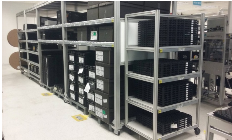
Figure 5. Final result of the Ford B479 line supermarket