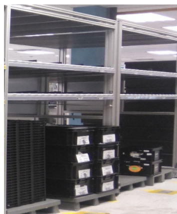
Figure 3. Changes 6, 7 e 8.

8 th Change: With a free pallet it was possible to remove two more painting trays from the Supermarket 1, leaving only the 6 painting trays for the 6 existing free positions. The trays were chosen based on the bottlenecks and the expected quantities of each reference by the end of the year.