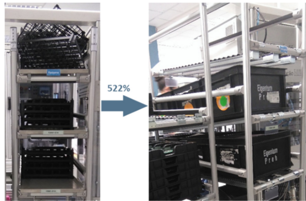
Figure 2. Change 5

6 th Change: Over time, it was realized that when it was necessary to make reference exchanges, there were many problems in the subgroup's supply system. This happened because there was only one position for all references, which implied that when the version of the final product was changed, there was a need for a full exchange at the exact moment of the change. For that reason, two more shelves were acquired, only with the two levels from above, in order to place them on top of the four existing pallets. These new shelves generated 16 new positions. With those positions it was possible to place two boxes of each reference of the subgroup in the supermarket, in order to guarantee that when there was an exchange of reference there were always at least 72 units in it..