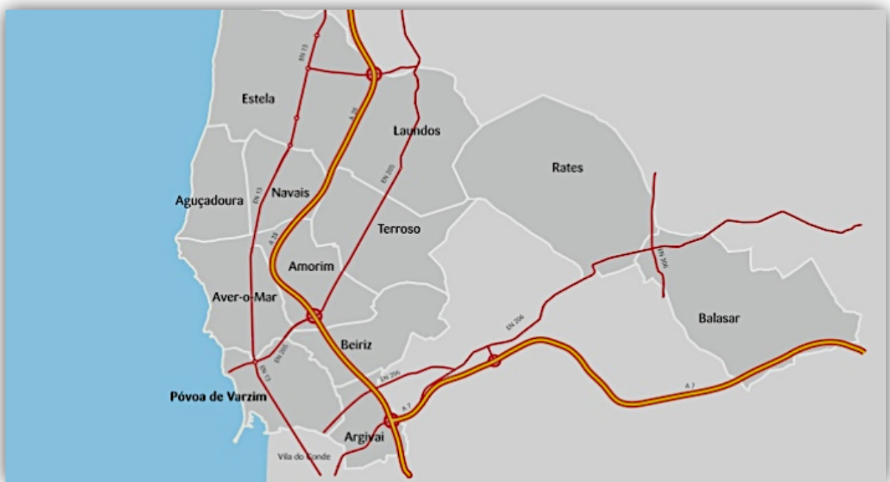
Figure 1- Map of the municipality of Póvoa de Varzim (Câmara Municipal da Póvoa de Varzim, 2023)

community services and are therefore unable to participate and socialize in the community, which negatively influences social activity (Hughes et al., 2019; Jones et al., 2023). Additionally, the rural environment offers less support and fewer opportunities to interact with family and friends, leading to a lack of social life and consequently feelings of social isolation and loneliness (Hussain et al., 2023; Moskalewicz et al., 2019) (Figure 2). The area of residence of the participants was the most important factor in this case, as the focus groups were held in four different parishes in Póvoa de Varzim . Most of the participants from Occupational Center of Lapa live in the center of Póvoa de Varzim , while those from Occupational Center of Aver-o-Mar live in Aver-o-Mar , which is one of the parishes closest to the center. On the other hand, the participants from Rates and Aguçadoura are further away from the center of Póvoa de Varzim (Figure 1).